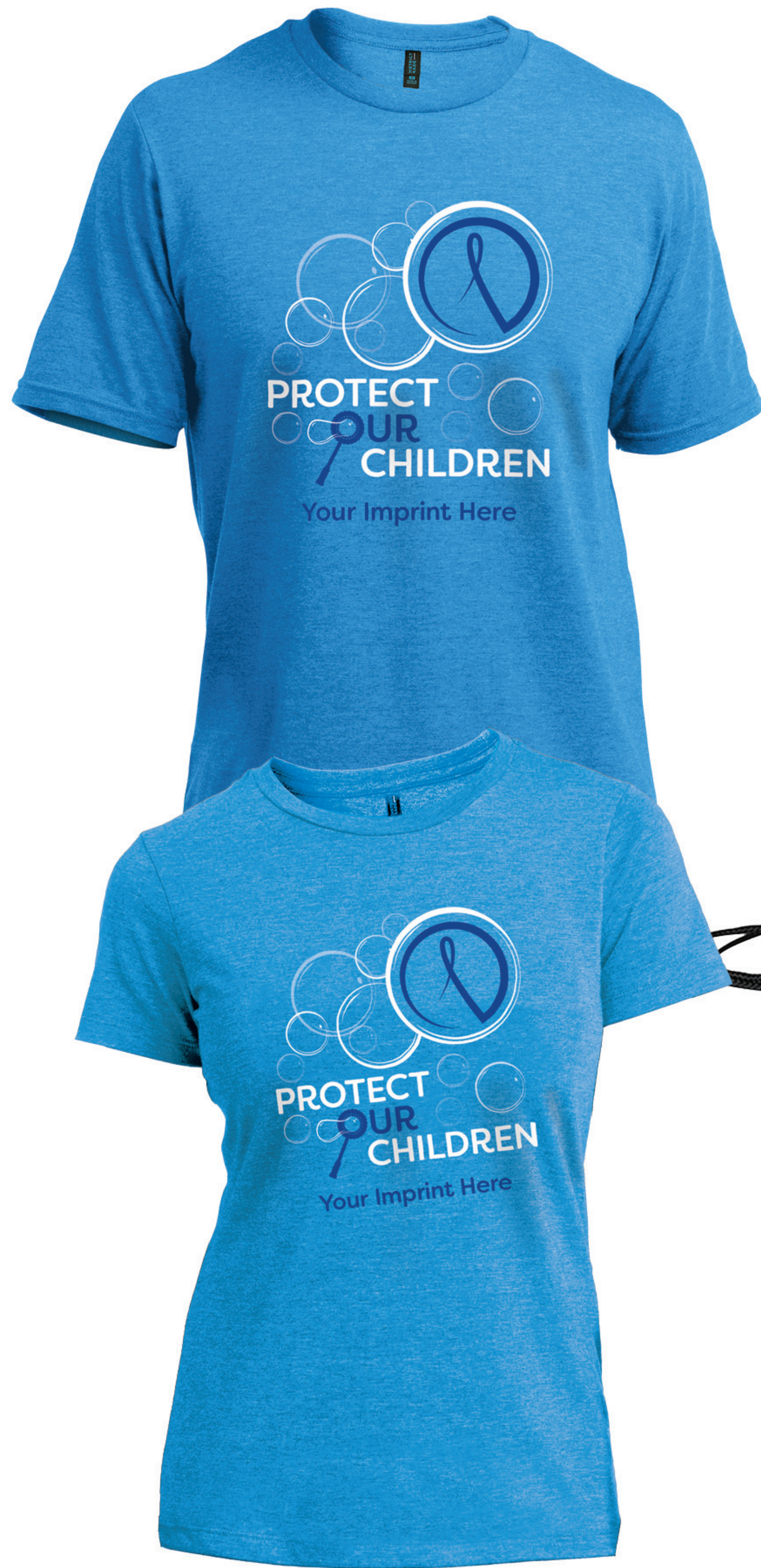
2673/2674 - AWARENESS T-SHIRT TEMPLATE: CA-02 Shown on Heathered Turquoise