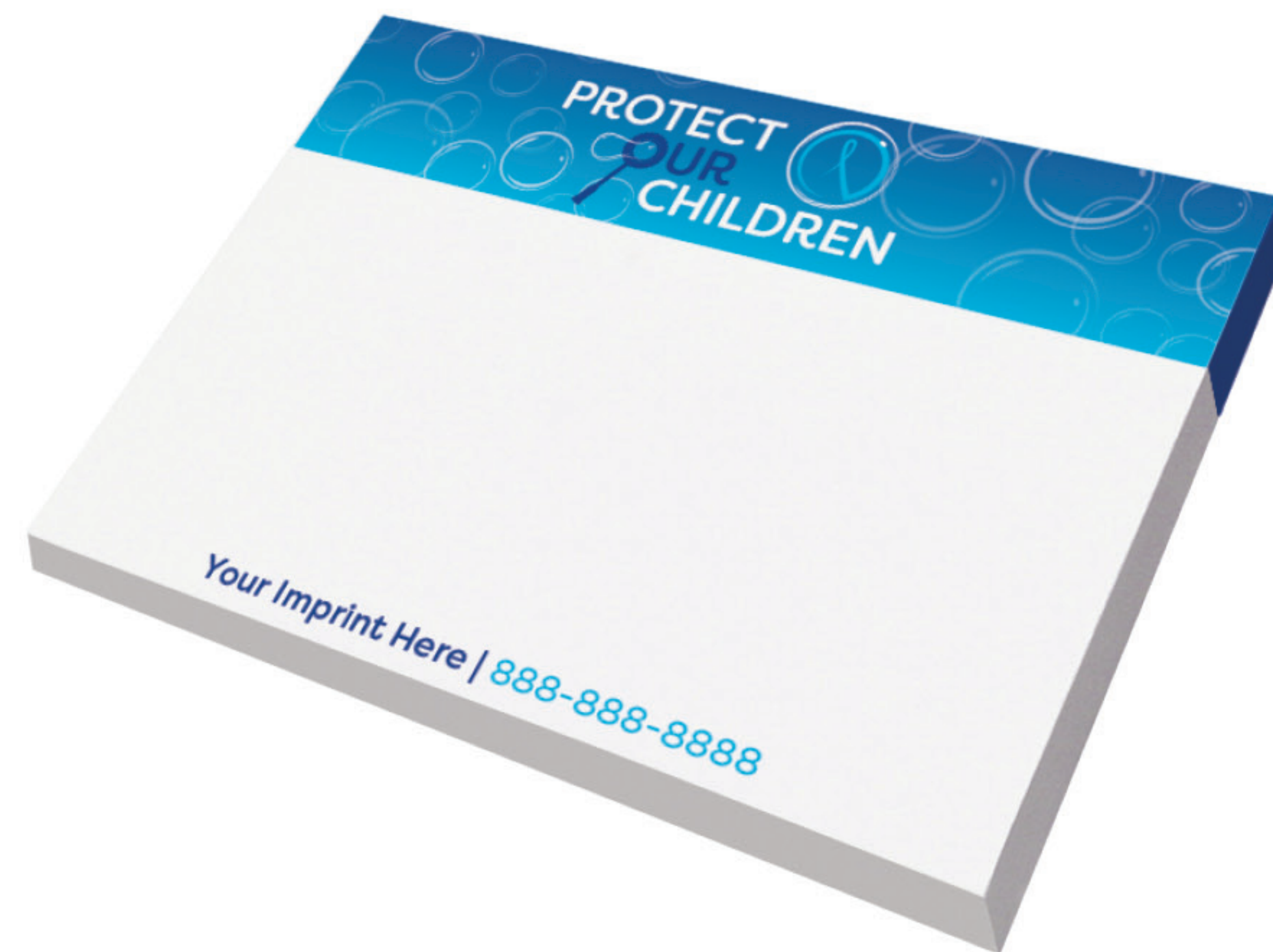
2433B - BIC STICKY NOTEPAD-50 TEMPLATE: CA-01