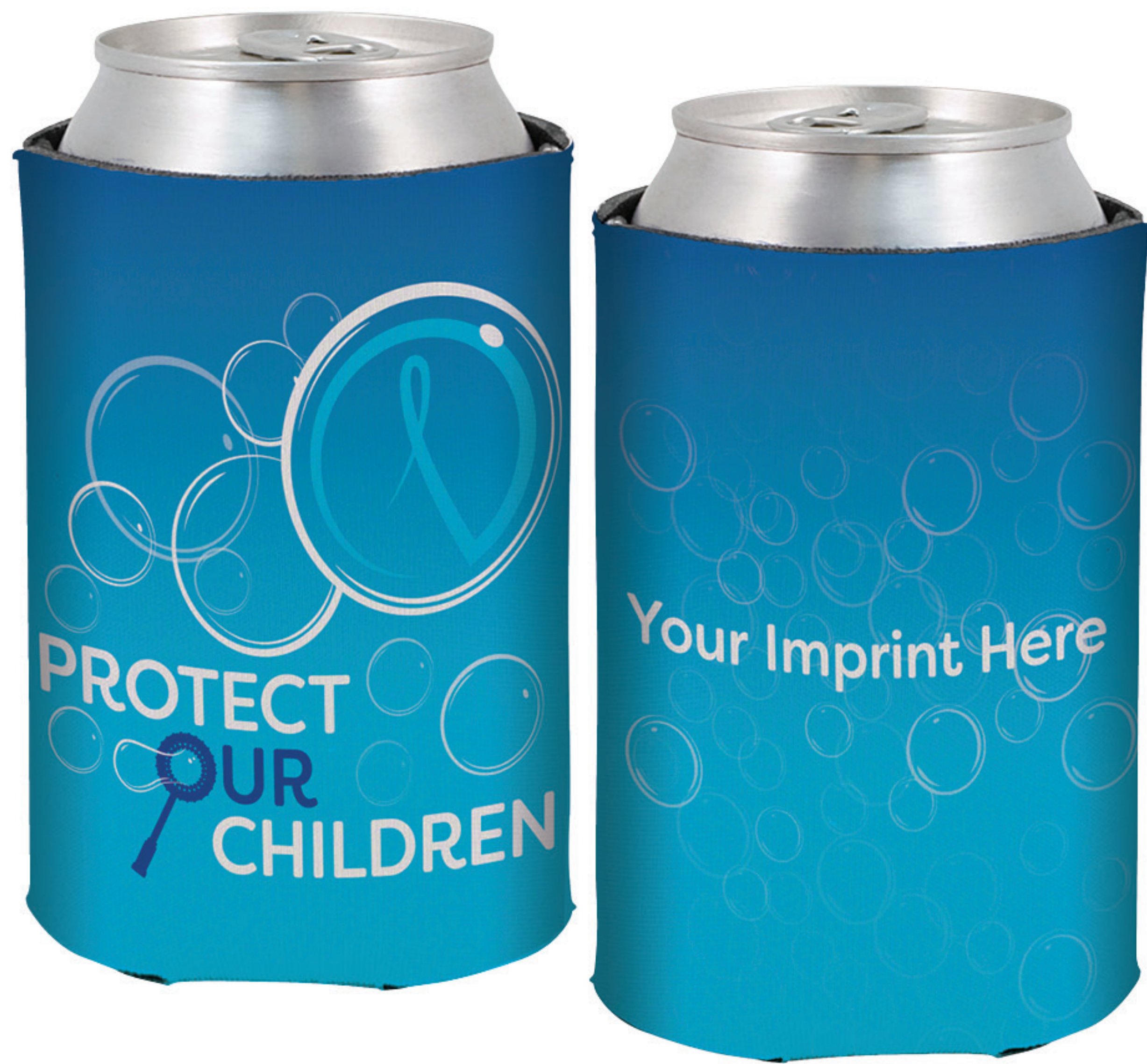
3096 - BE RESPONSIBLE CAN INSULATOR TEMPLATE: CA-01