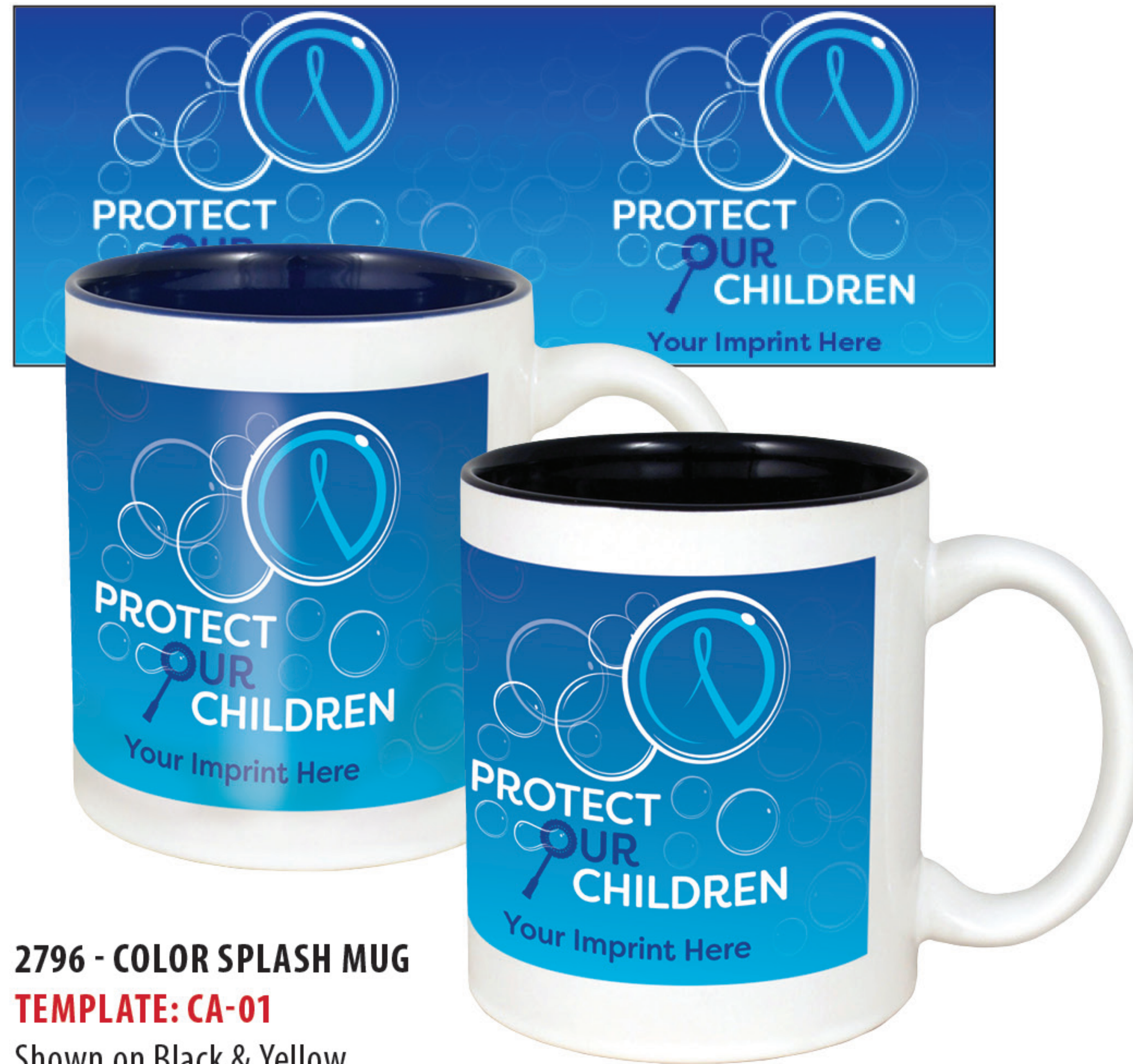
2796 - COLOR SPLASH MUG TEMPLATE: CA-01 Shown on Black & Yellow