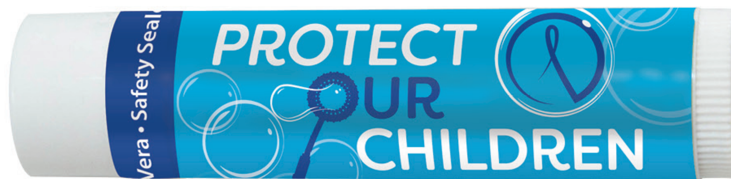
1745A - AWARENESS LIP BALM TEMPLATE: CA-02