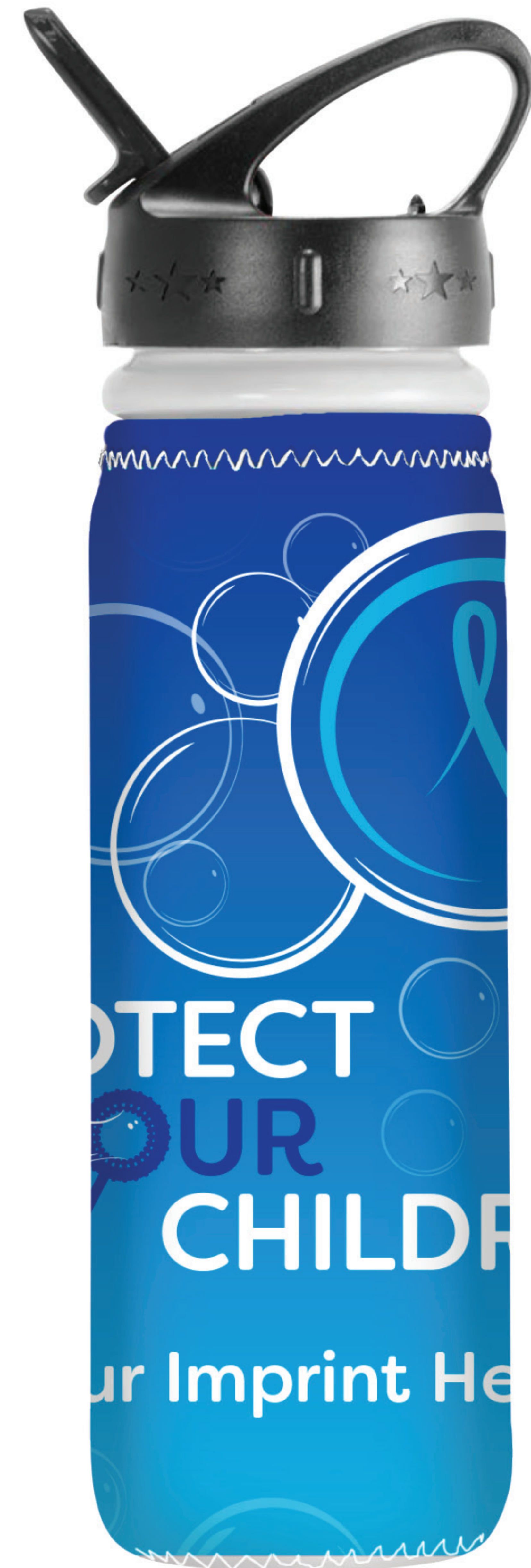
3025 - CAMPAIGN BOTTLE TEMPLATE: CA-03