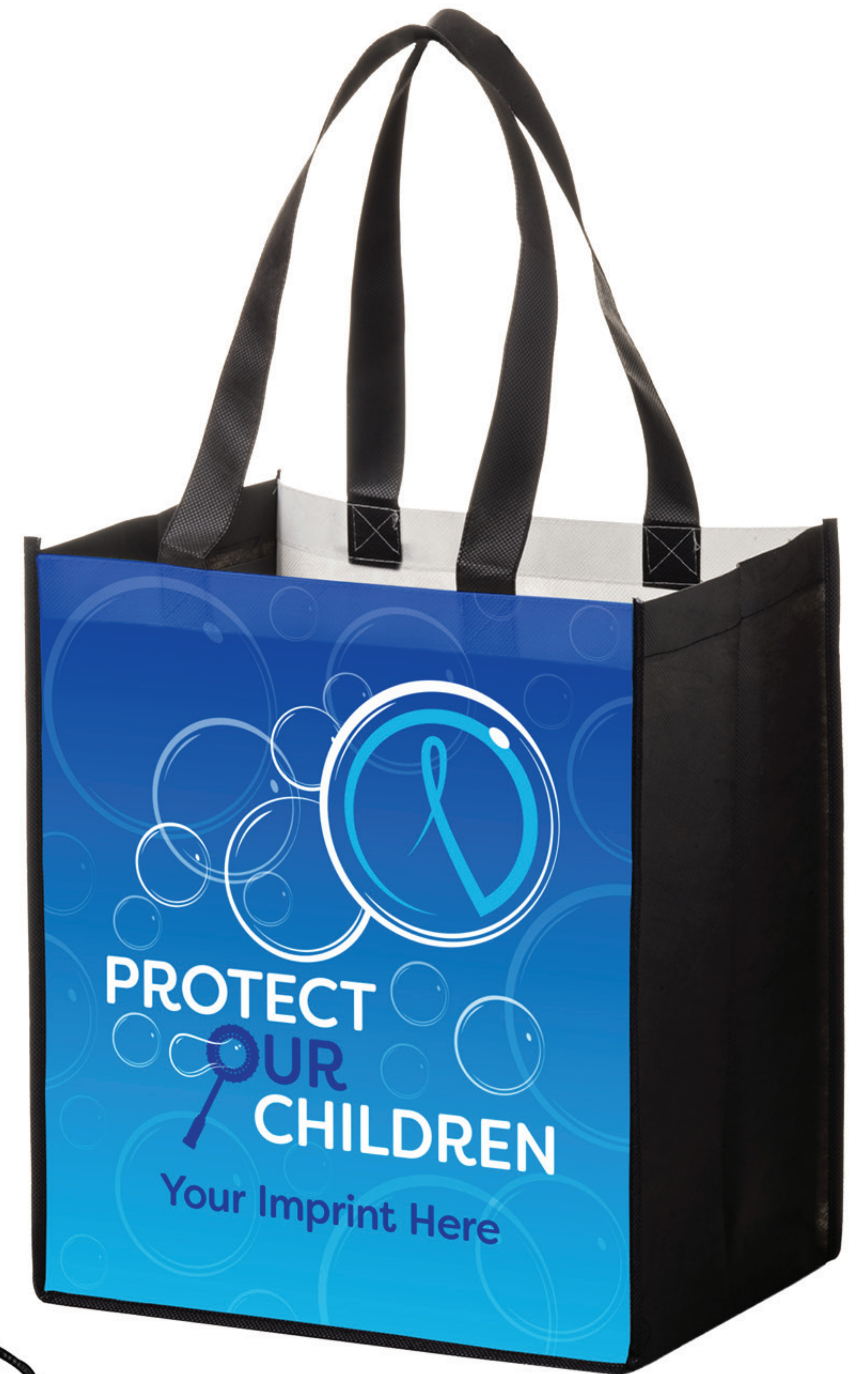
3350 - PROGRAM GROCERY TOTE TEMPLATE: CA-03