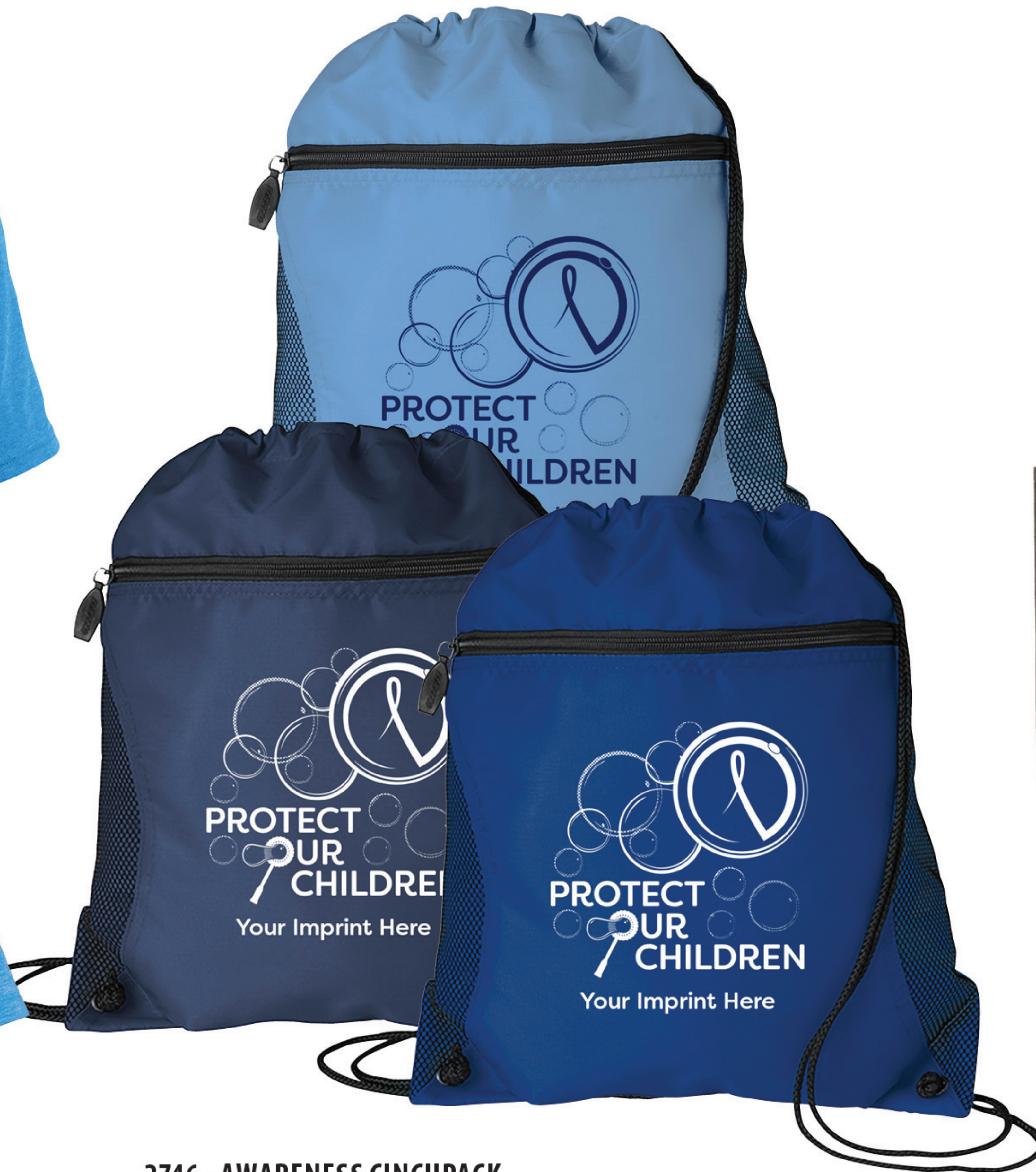
2746 - AWARENESS CINCHPACK TEMPLATE: CA-02 Shown on Light Blue, Blue, & Navy