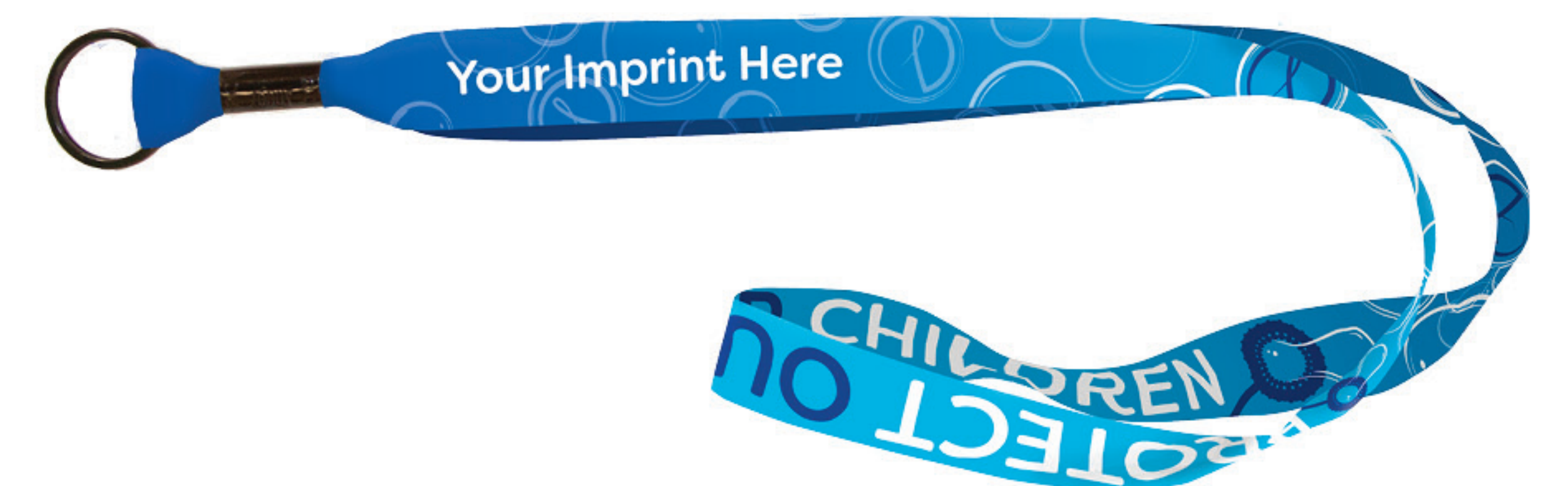
3024 - AWARENESS LANYARD TEMPLATE: CA-02