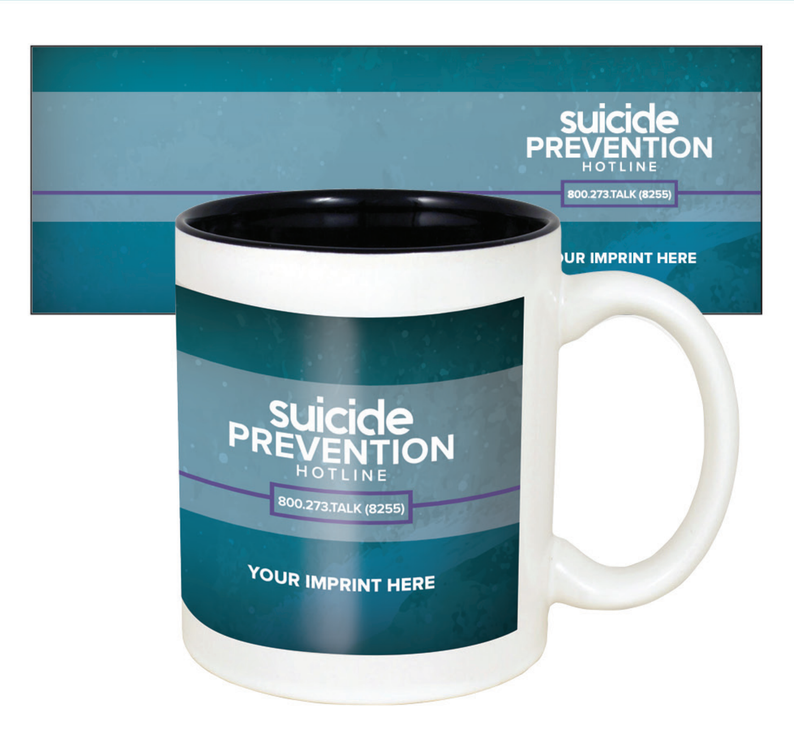
2796 - COLOR SPLASH MUG TEMPLATE: SU-11 Shown on Black